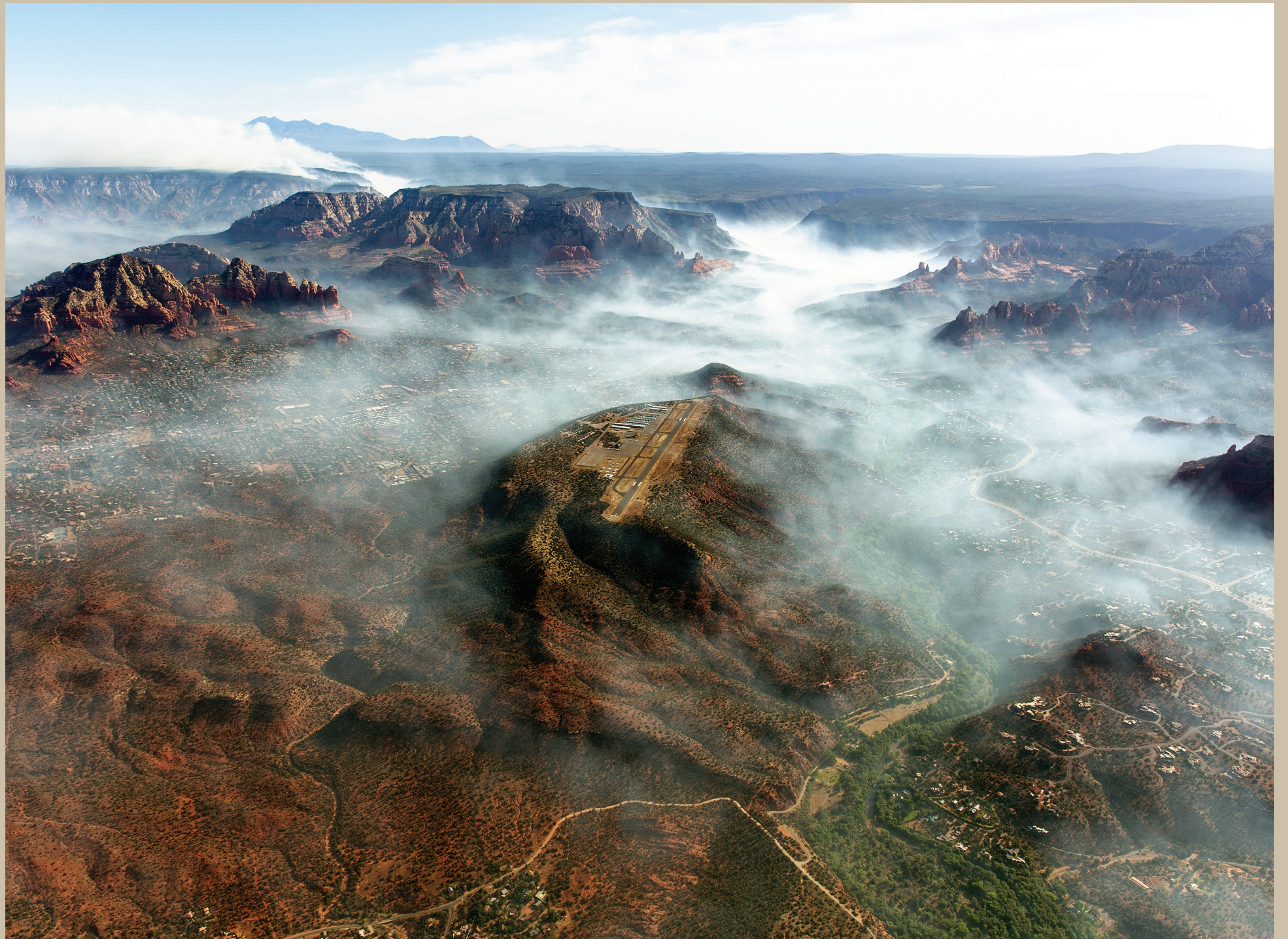
Ted Grussing - www.tedgrussing.com

In May of 2014 , a careless spark near Slide Rock State Park ignited a wildfire that quickly climbed up Oak Creek Canyon and scorched more than 20,000 acres in just 7 days. Extreme terrain and windy conditions complicated efforts to contain the flames, which caused mandatory evacuations for many residents and visitors in the canyon.